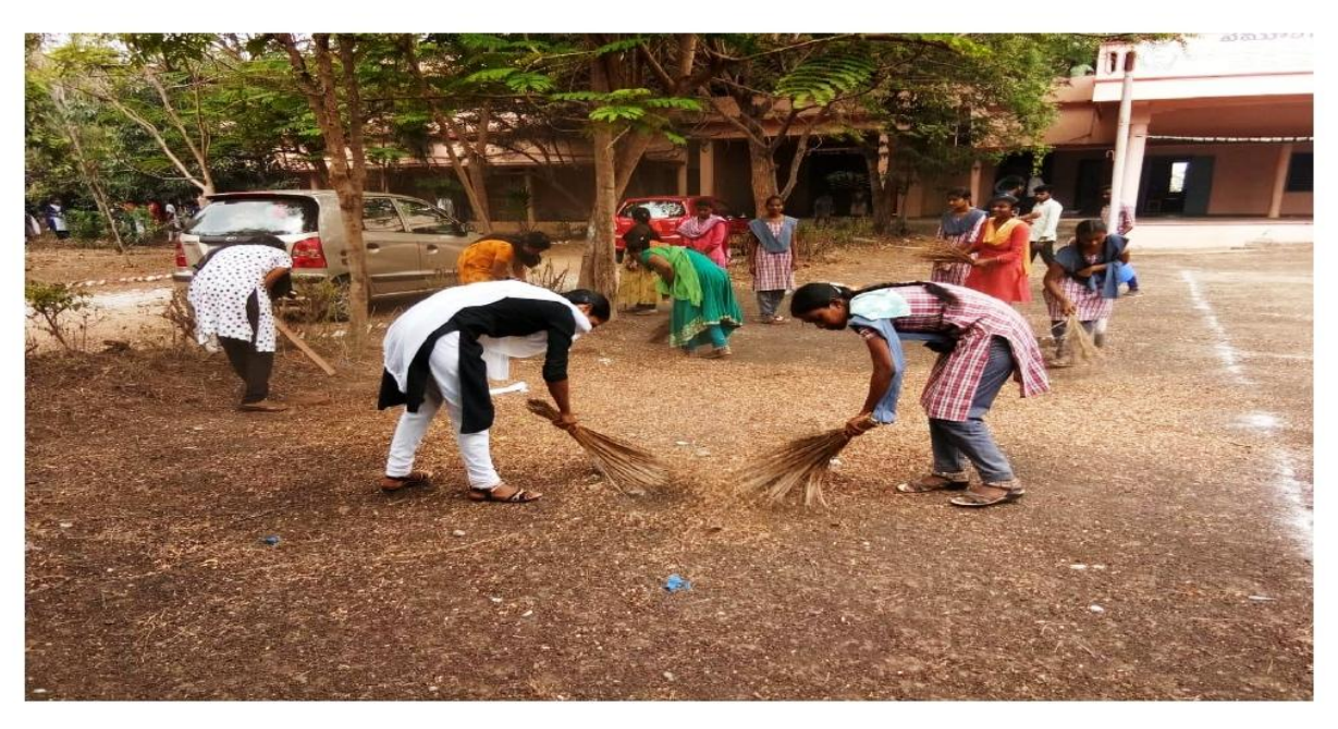
NSS volunteers are participated in the college cleaning programme