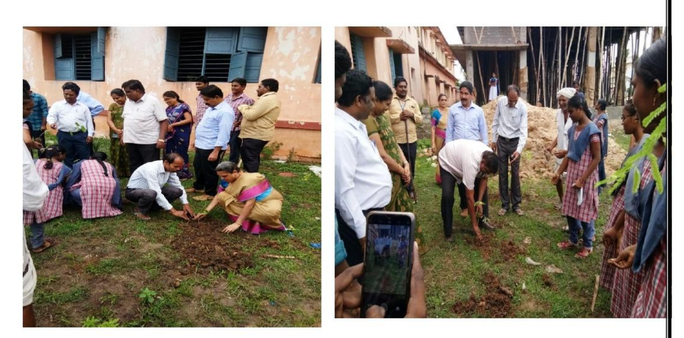
Saplings in the premises of the college